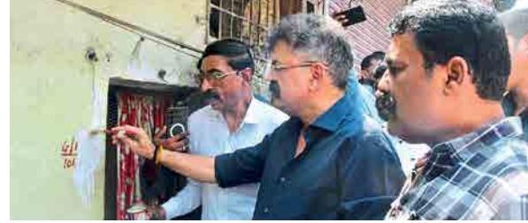
ठाणे : प्रस्तावित समूह विकासाला शहरातील रहिवाशांनी विरोध केला असून त्याला शनिवारी आमदार जितेंद्र आव्हाड यांनी पाठिंबा दर्शविला.

क्लस्टर योजना ठाण्यात राबविली जात आहे. अनधिकृत धोकादायक इमारतीमध्ये राहणाऱ्या रहिवाशांना हक्काचे घर मिळावे, हा या क्लस्टरचा मुख्य हेतू होता. पण आता क्लस्टरच्या नावाने पालिका प्रशासनाने मनमानी सुरू केली असल्याचा आरोप होऊ लागला असून, अनेक ठिकाणी त्याला विरोध दर्शवला जात आहे. एसआरए, पुनर्विकासाच्या मार्गावर असलेल्या आणि म्हाडा भूखंडावरील रहिवाशांनी याआधीच क्लस्टरविरोधात भूमिका घेतली आहे. त्यात आता मानपाडा, मनोरमानगर, आज्ञादनगर आदी परिसराचीही भर पडली आहे.