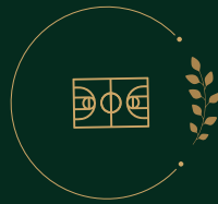
Multipurpose sports court