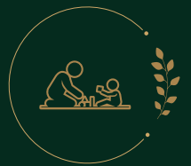
Indoor kids' play area