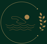
Olympic-length swimming pool