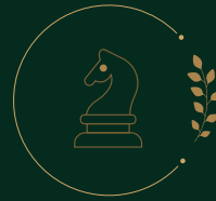
Indoor games room