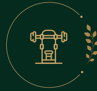
Outdoor fitness area