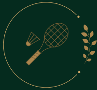
Two badminton courts