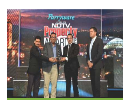
Happinest Avadi received the 'Best Low-Cost Housing Apartment Project of the Year' at the NDTV Property Awards 2016.